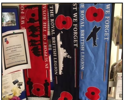
STUNNING scarves are on sale at VIC for the Haslingden Branch of The Royal British Legion. The scarves are only £10, the quality is great and there is an army, navy and RAF scarf. To order yours, call in at the VIC Centre.

Members have also been preparing the beds in the rear garden for this year's planting.