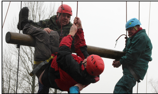
Team building picture special coming soon

The cost is £45 and all materials are supplied including tea and coffee, but a packed lunch is advised. The class starts at 10.30am and normally finishes around 3.30pm, but places are limited.