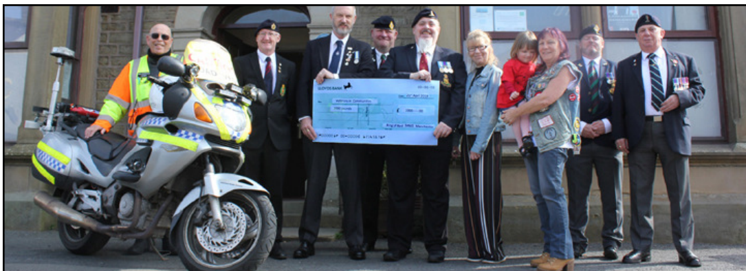
BIKERS who joined the Ride Of Respect by wearing a red T-shirt and riding their bikes around the M60 to form a poppy raised £2,000 for VIC. The bikers received a warm welcome when they visited our centre to present the money.