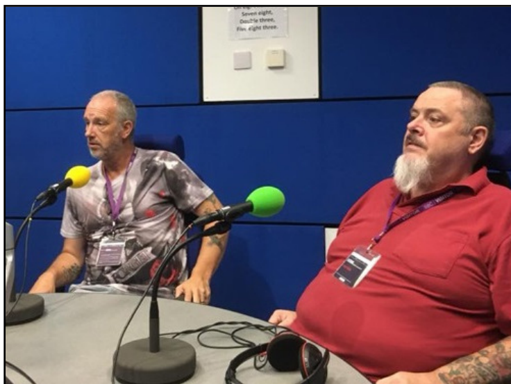
Medal Association. All three talked about their service