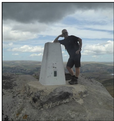
WALKERS enjoyed spectacular views from the trig point on Blackstone Edge. On the way down they also encountered the impressive wildlife made from wood at Animal Elegance.