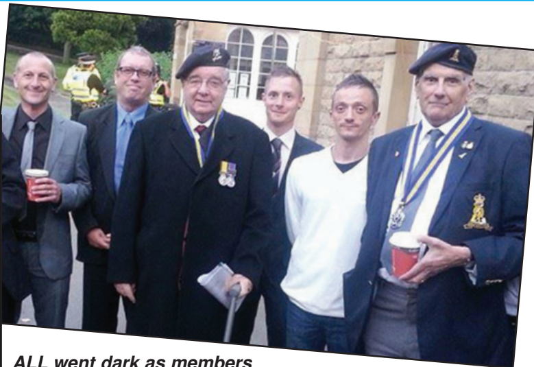
ALL went dark as members of VIC Darwen Outreach joined in the 'lights out' commemoration for the start of the First World War. For an hour, all electric lights were extinguished and just a single candle was used for illumination.