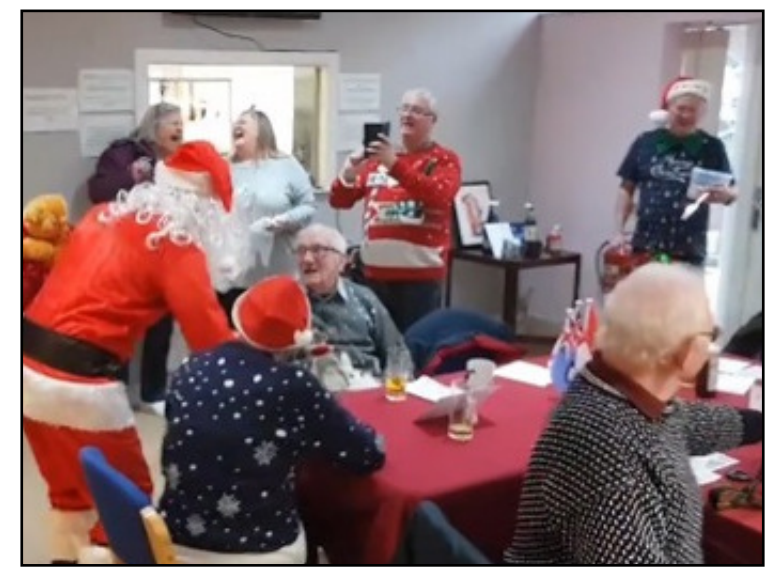
Thank you to the 'man in red' for making a guest appearance at VIC's The Sandbag Café in Heywood and spreading some Christmas joy.

"It was a very well organised event so well done to the club, a lot of hard work went into putting the night together."