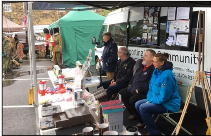
VIC was represented at the Preston Military Show, but the bad weather meant there was a lot less to see and visitors were fewer in number.