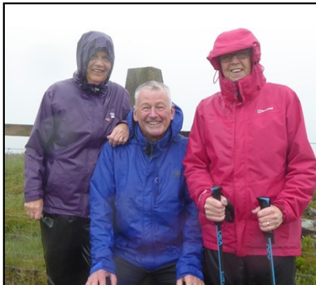
WALKERS had an enjoyable trek on the moors to Hog Lowe Pike and then back to Clough Head Café in Haslingden.

Any money raised gets shared between local charitable groups and VIC is one of the lucky recipients. Leave books at the centre or call 01706 833180.