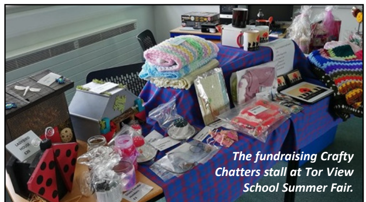
The fundraising Crafty Chatters stall at Tor View School Summer Fair.