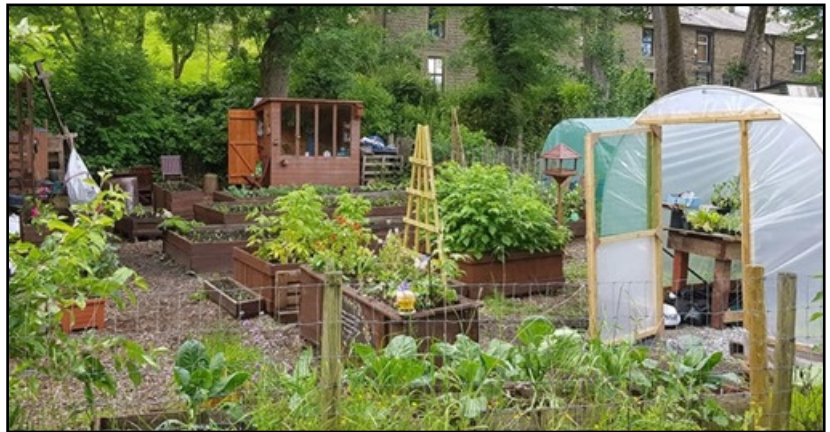
Our allotment in Helmshore is is blooming and set to yield a bumper crop. Thank you to everyone who has helped to tidy it up and plant donations from Dig In North West.

"We will definitely be holding the event again."