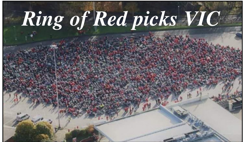
Ring of Red picks VIC

BIKERS taking part in the Ring of Red Remembrance ride around the M60 circling Manchester will be supporting the work of VIC.