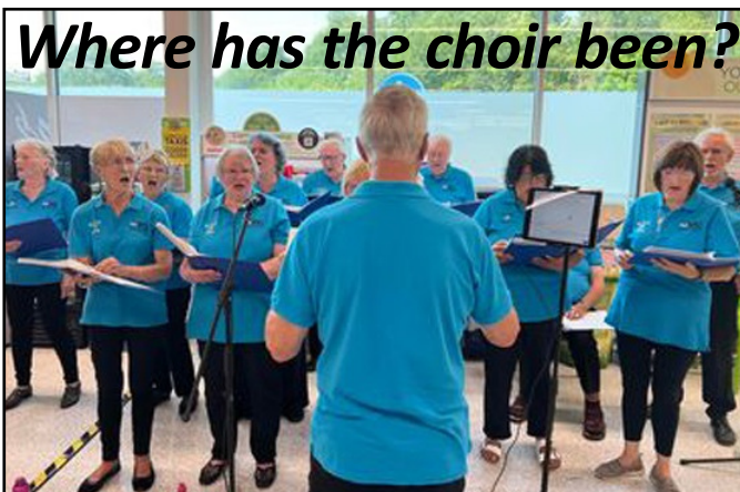
Where has the choir been?

THE VIC Choir had a terrific reception at Asda in Rawtenstall and raised £420.94.