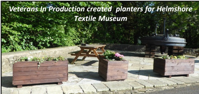
Veterans In Production created planters for Helmshore Textile Museum