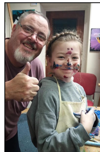
Fun at the Bob Ross painting class - see page 3

The Crafty Chatters group is open to all.