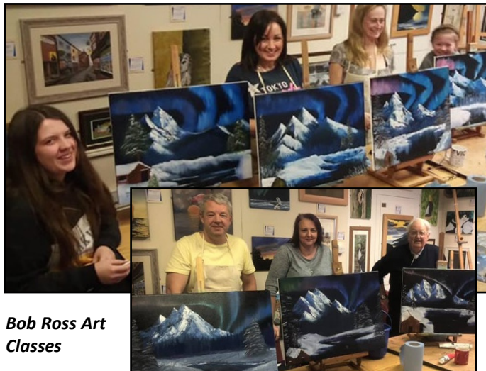
Bob Ross Art Classes