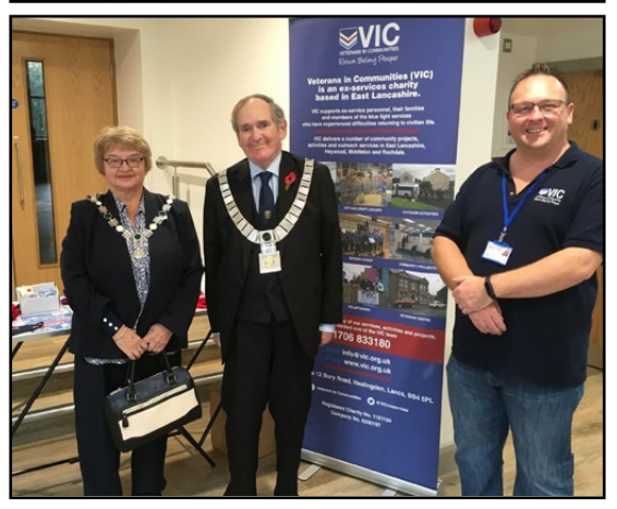
A big thank you to Ribble Valley Borough Council for supporting our outreach. VIC has received a grant of £500 via the Voluntary Organisation grant scheme and this will be utilised to ensure the VIC outreach in Clitheroe can continue to grow..