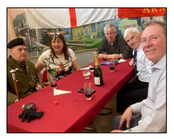
St George's Day was celebrated in style at The Sandbag Cafe in Heywood. VIC's outreach meets every Tuesday morning at

He is hoping to be able to join the charity on an archeological dig in Belgium later in the year.