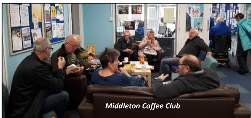
Middleton Coffee Club

Thank you to all the regular members and visitors who attended and the committee that run the coffee morning every week.