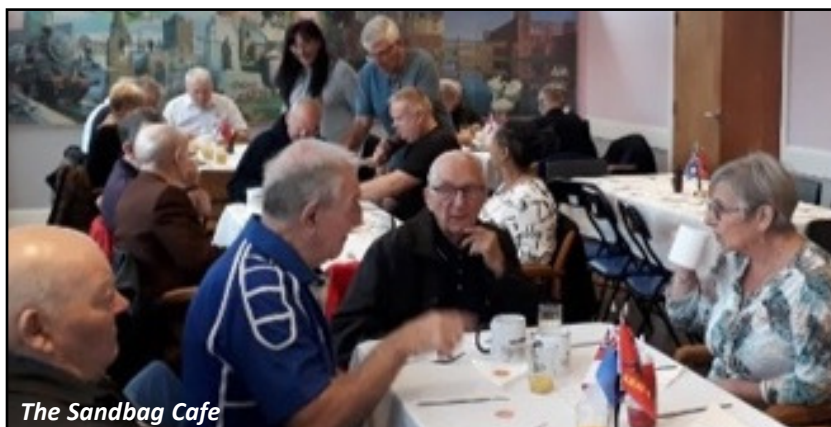
The Sandbag Cafe