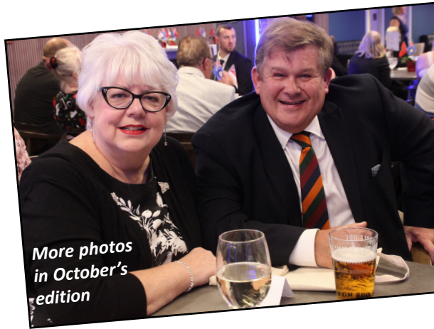
More photos in October's edition